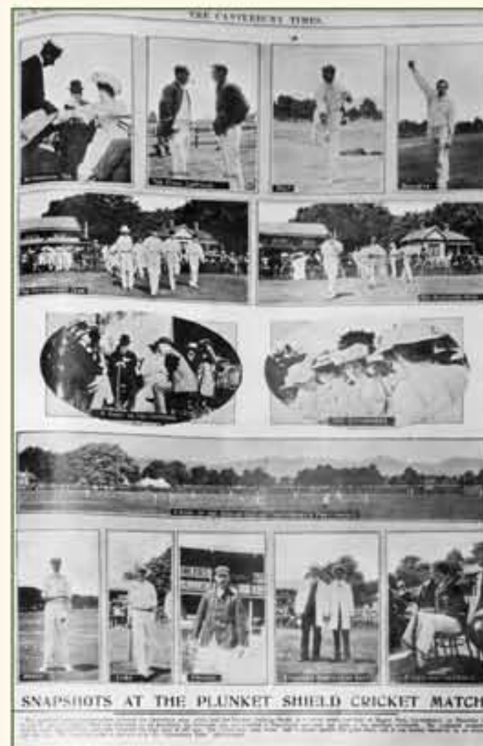
Snapshots at the Plunket Shield Cricket Match 1907 Auckland v Canterbury, Hagley Park, Christchurch