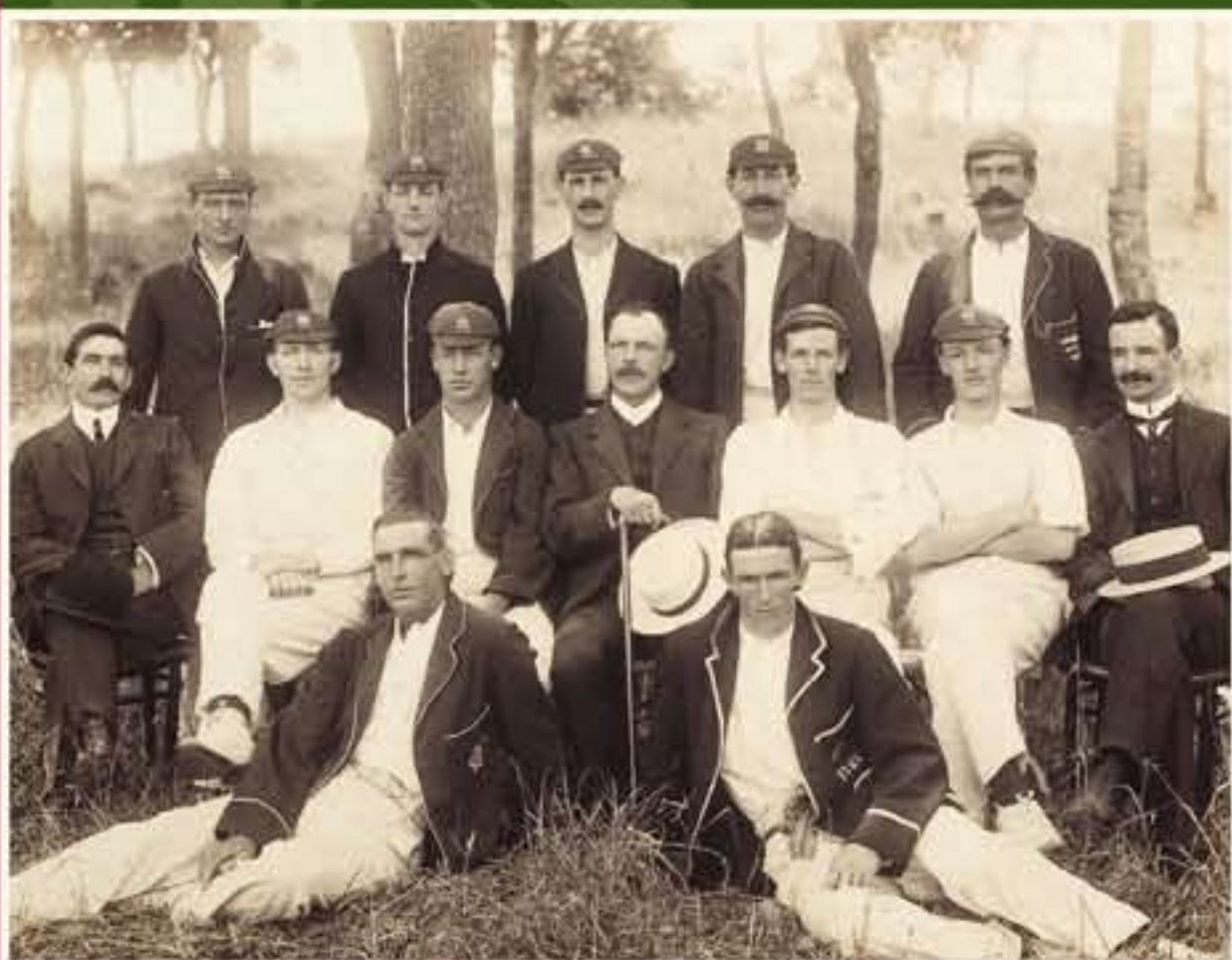
Auckland Cricket Team – Plunket Shield Winners, 1907-08 The Historic First Winners of the Plunket Shield