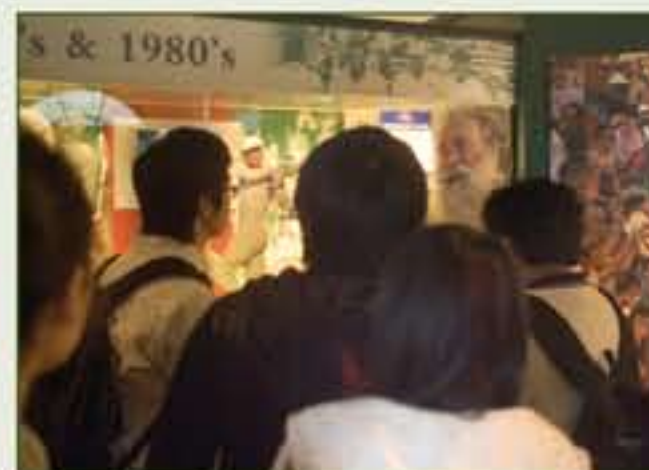
Students from the "Making Futures Happen" Academy being introduced to the "1970's & 1980's" display 30.11.07

In anticipation of groups of English supporters following the test series between New Zealand and England in February/March 2008, the museum is providing discount vouchers in partnership with New Zealand Cricket. Also, the museum has contributed three articles on displays with a NZ/England connection to the Souvenir Test Series Programme – Black Caps v England 2008. These marketing strategies should help to increase visitations and awareness of the museum.