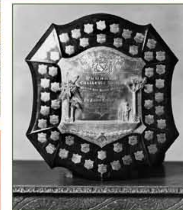
The Plunket Shield